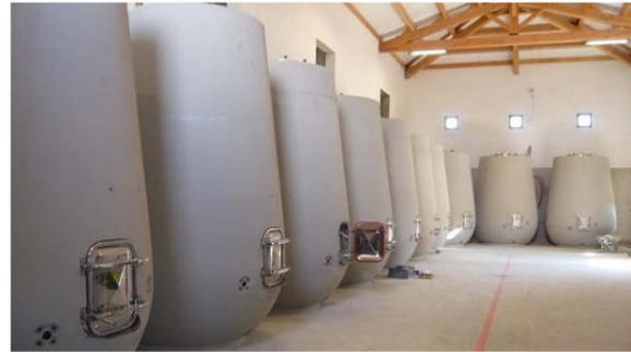
Domaine La Barroche's new winery, with ultra-modern, tulip-shaped concrete tanks

Wine lovers who gravitate toward structured Châteauneuf-du-Papes are going to be thrilled by the style of the 2013s, while those who are drawn to more flamboyant, fruit-driven, immediately approachable wines are likely to prefer the 2014s.